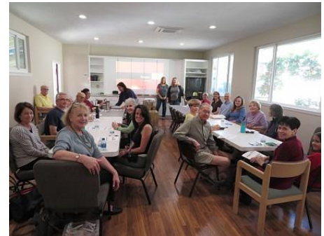
24 tutors and site supervisors attended this training. Hope to see you all at the next one on March 9 th .