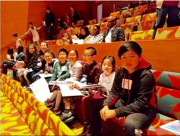
CVA students waiting for the concert part of the day's activities to begin.