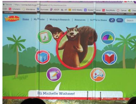
Accessing the Wonders web page, on an i-Pad, this is what the new program looks like.