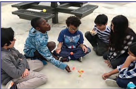
Enjoying a game of jacks

At CLASP students spend an hour working with a tutor and an hour playing with their friends under the guidance of two recreation leaders. They often eat cheese sticks or apples and relax after a long day in the classroom.