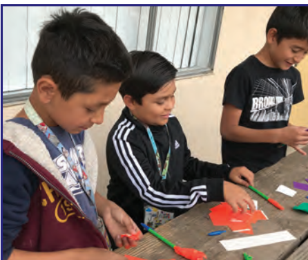
Flower pen craft project

“What will we play today?” Usually the rec leaders decide, but sometimes the children do, or someone draws the name of an activity out of a hat. Sharks and minnows vies with soccer and capture the flag as favorites.