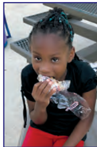
Honor on a snack break

Some days are for crafts. You can make your own nametag, a thank-you note for your tutor, or a flower pen to give your mom on Mother’s Day. (The colorful, sticky tape for the flowers is a donation from Joann Fabrics.)